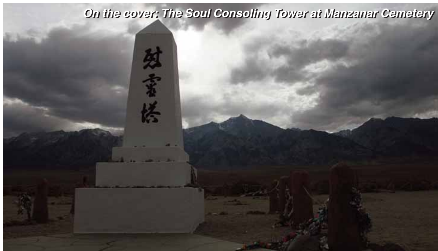
On the cover: The Soul Consoling Tower at Manzanar Cemetery

Manzanar Pilgrimage .....8 Diaz Lake.....10 Bishop Mule Days Celebration .....11 Mammoth Mountain .....12 Ridgecrest area museums .....14