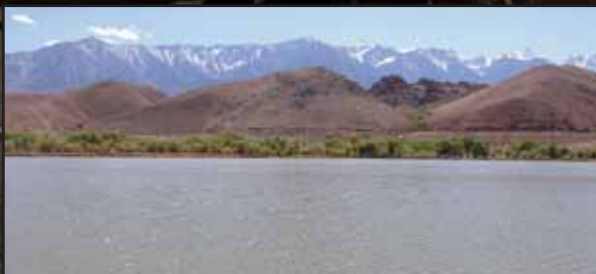
Extraordinary Diaz Lake