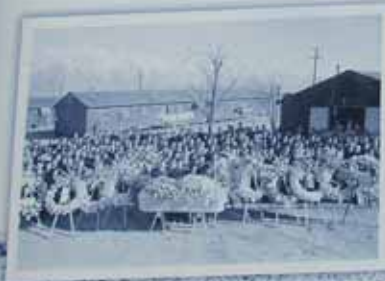
An interpretive marker explains the sacred spaces at Manzanar National Historic Site