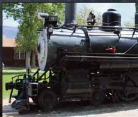
The story of the Laws