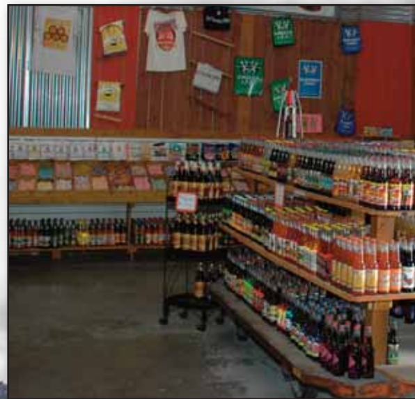
Sodalicious at Indian Wells Brewery