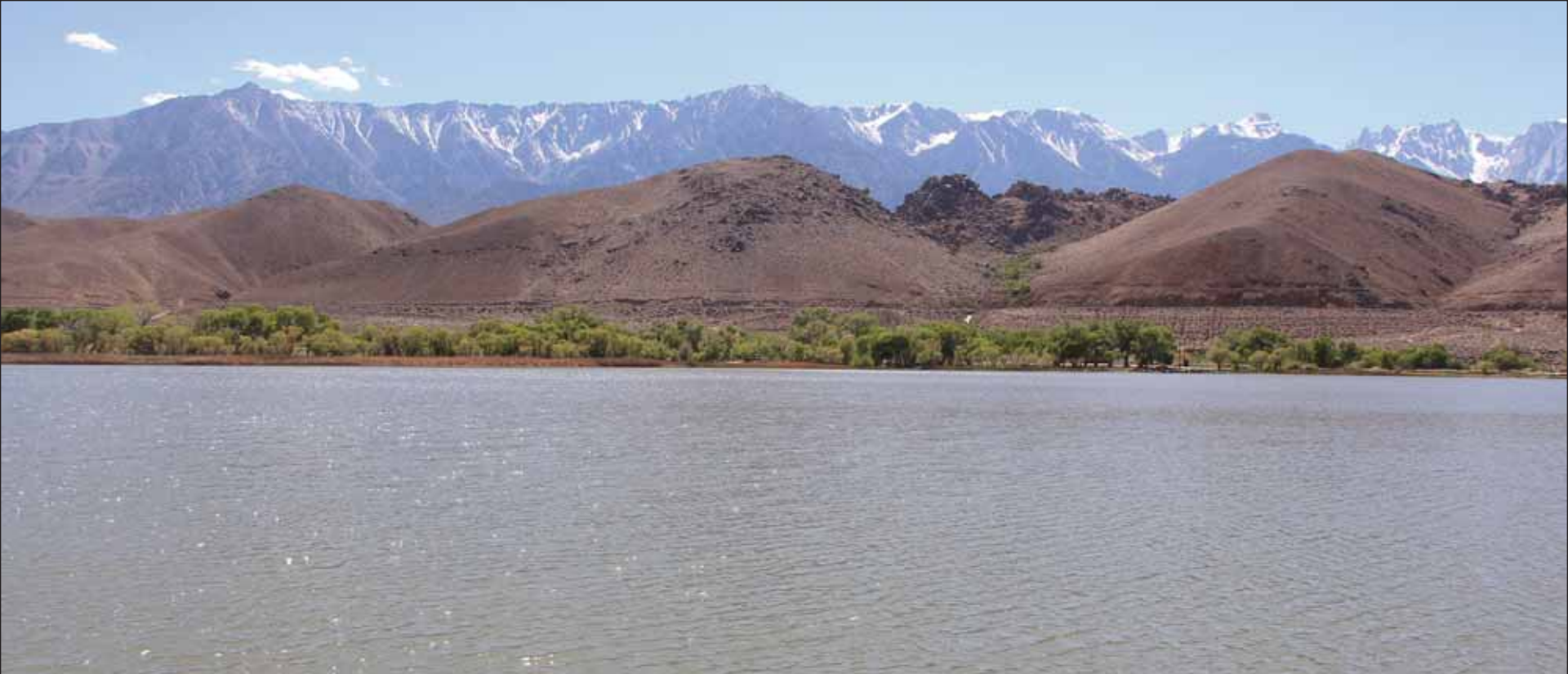
A view, looking west, of Diaz Lake. The Sierra Nevada grace the lake, just behind the campground.