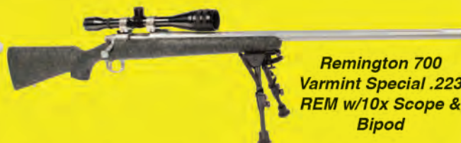
Remington 700 Varmint Special .223 REM w/10x Scope & Bipod