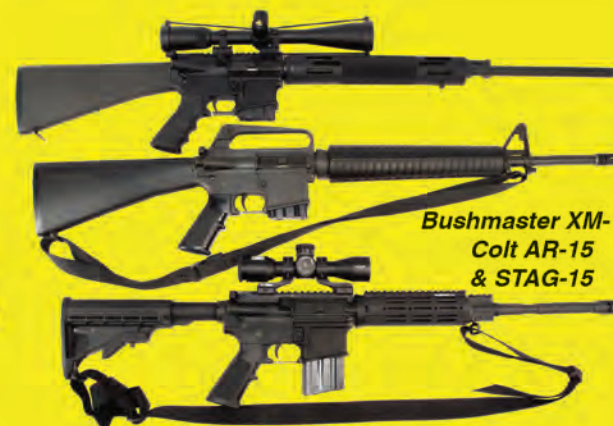
Bushmaster XM-15, Colt AR-15 & STAG-15