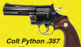
Colt Python .357 Magnum, 4" Barrel, ca. 1969