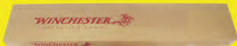
Winchester Model 70 Super Grade .30-06 SPRG., Unfired in Box!

SELLING OVER 1000 LOTS OF MODERN & ANTIQUE SHOTGUNS, RIFLES, HANDGUNS, AMMO, HUNTING & FISHING ITEMS FROM LOCAL ESTATES & LOCAL GUN SHOP WITHOUT RESERVE REGARDLESS OF PRICE TO THE HIGHEST BIDDER!