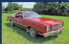
1977 Monte Carlo, 50K Miles