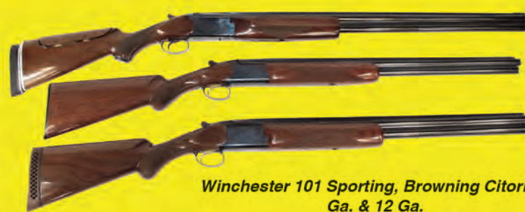
Winchester 101 Sporting, Browning Citori 20 Ga. & 12 Ga.