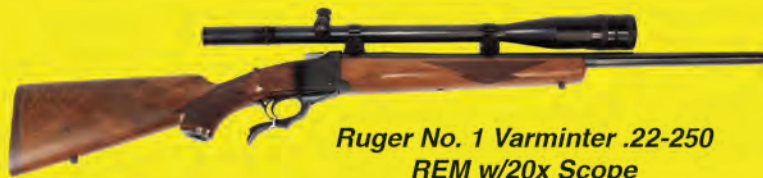
Ruger No. 1 Varminter .22-250 REM w/20x Scope