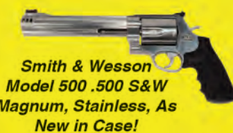
Smith & Wesson Model 500 .500 S&W Magnum, Stainless, As New in Case!