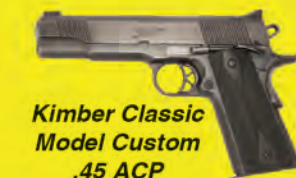
Kimber Classic Model Custom .45 ACP