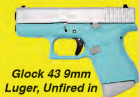
Glock 43 9mm Luger, Unfired in Case!