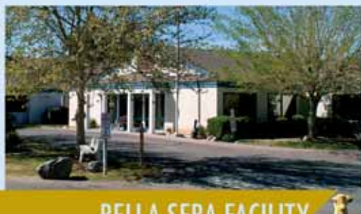
BELLA SERA FACILITY

At Bella Sera we understand being away from home is difficult but we strive to make our residents and families feel at home and to feel that they are part of the team managing their care. Whether your needs are short term or long term placement, we partner with the resident and family to ensure that our residents are given the best care possible right here in their community.