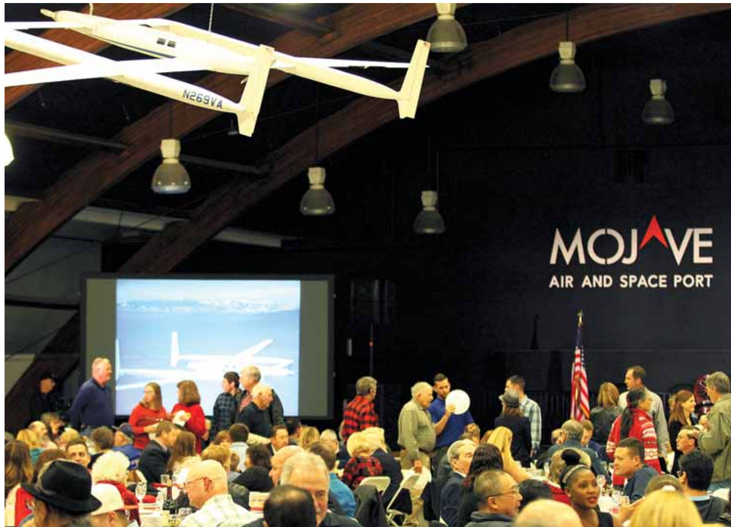
A packed house at the Stu Witt Center for the Voyager 30th Anniversary Banquet at Mojave Air and Space Port.

So many details and anecdotes of the flight have been recounted over the years since the successful flight and its aftermath, much of which is not good for the brothers, who quickly found themselves the darlings of Hollywood and the media, only to be treated badly