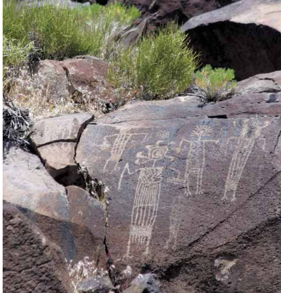
More than 250,000 pre-historic rock art petroglyph drawings can be found at the Coso Rock Art National Historic Landmark in the Mojave Desert, located on 36,000 acres at Naval Air Weapons Station China Lake, California.

"Sometimes it's really nice to just take a break and sit on a handy rock, breathe in and out, and listen to the quiet," Saholt said. "The glyphs will speak to you wordlessly. This is a great place to meditate for a few minutes every so often, in between the hiking and discovery stages. I recommend bringing a camera with lots of capacity, and extra batteries. The canyon itself is like a rip in Mother Earth's skin, in a volcanic area, so it looks toasted from the air. I'm told that 'Coso' means fire. In that narrow canyon, the light changes are dramatic — some designs can only be seen in certain light, and virtually not at all when the light changes. People who have been going to the canyon for 50 to 60 years say they see something they didn't remember seeing before, every time they go there. I've only been there about 30 times, and I know that's true. It's an amazing