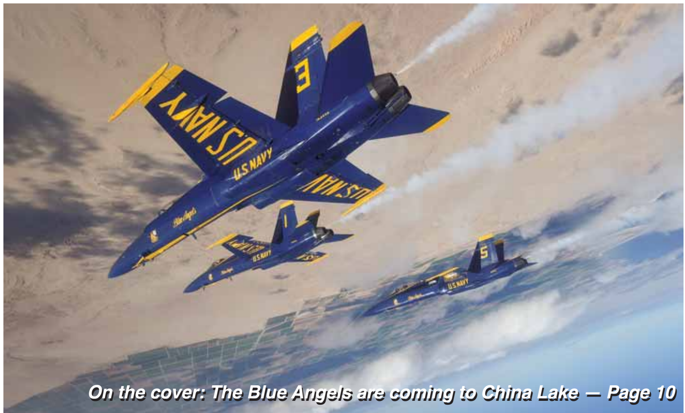
On the cover: The Blue Angels are coming to China Lake — Page 10