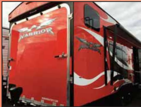
2017 WEEKEND WARRIOR, JJ2900 13+

Bobby Wayne's RV is adding a new location in Lancaster!