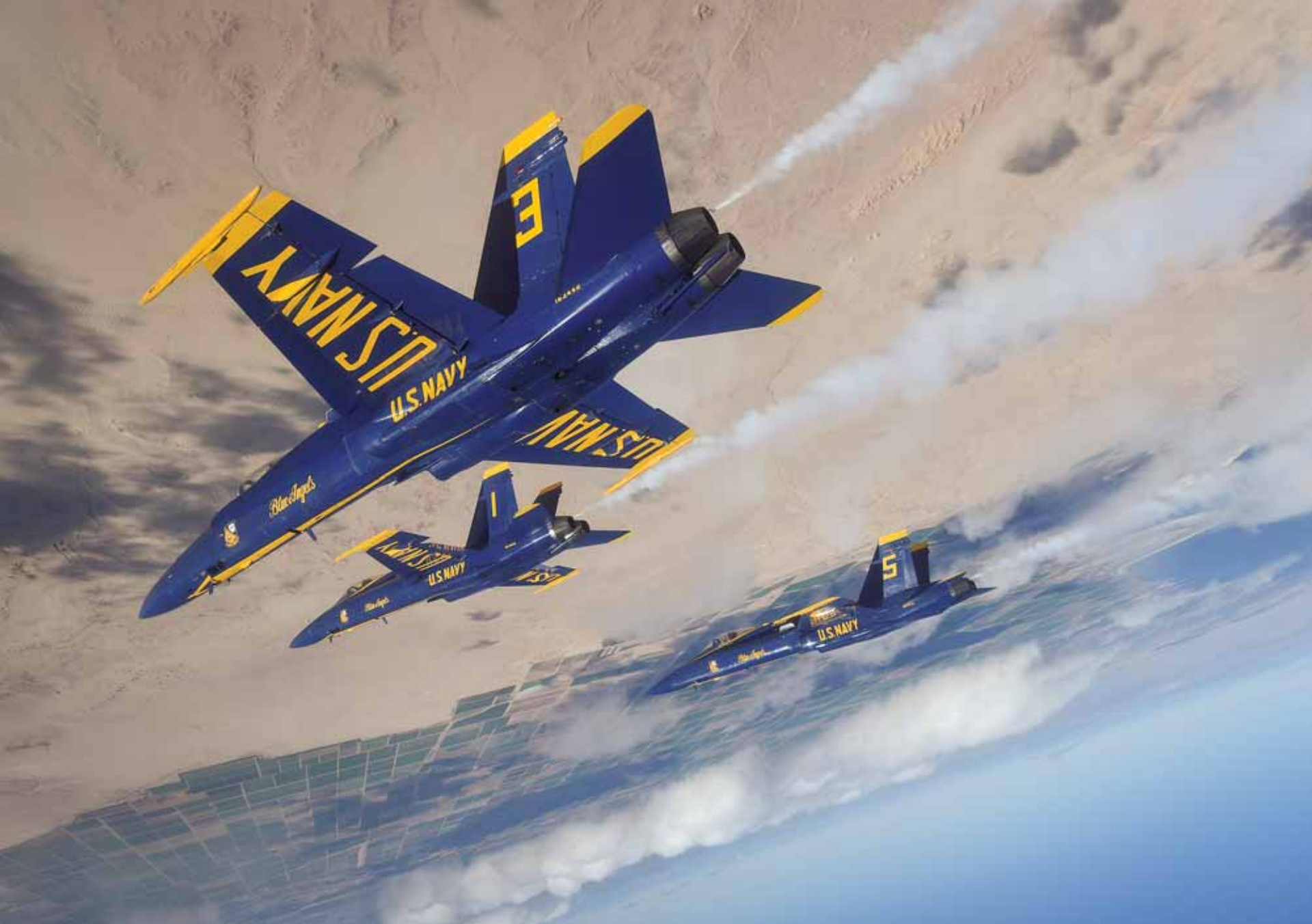
U.S. Navy Flight Demonstration Squadron, the Blue Angels, conduct a training flight over El Centro, Calif., in January 2017. Blue Angels pilots will complete 120 practice flights before kicking off the 2017 air show season.