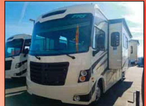
2017 FR3 29DS

We would like to thank the Antelope Valley for your support.