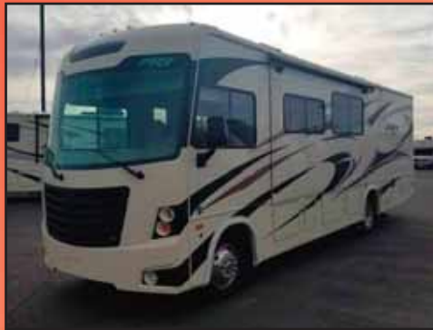
2017 FR3 30DS