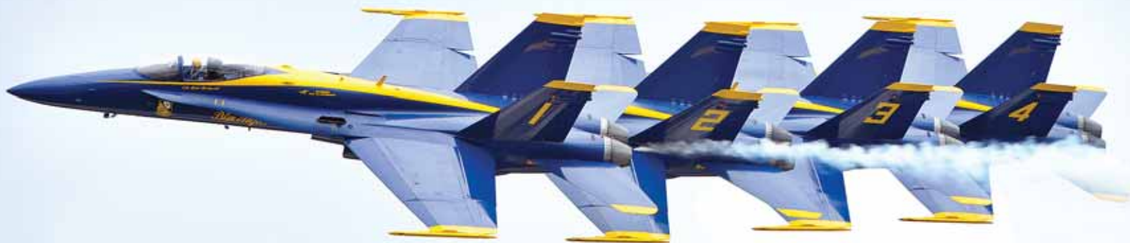
U.S. Navy Flight Demonstration Squadron, the Blue Angels, Diamond pilots perform the Echelon Parade maneuver at the Sioux Falls Airshow, Power on the Prairie, in July 2016.

this base in terms of providing for the national security of this nation.”