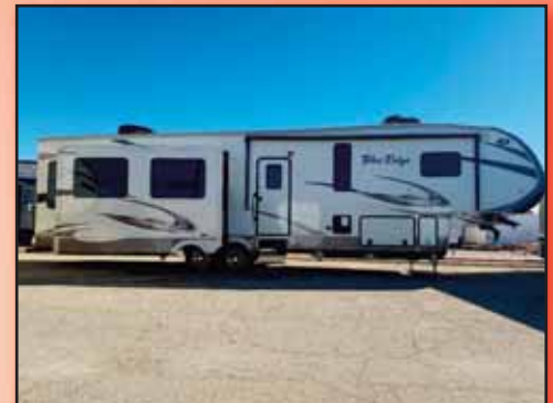
2017 BLUERIDGE 3780 LF