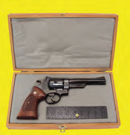
S&W Model 25- 1955 Target Model .45 Colt - As New!