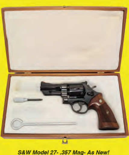
S&W Model 27-.357 Mag- As New!