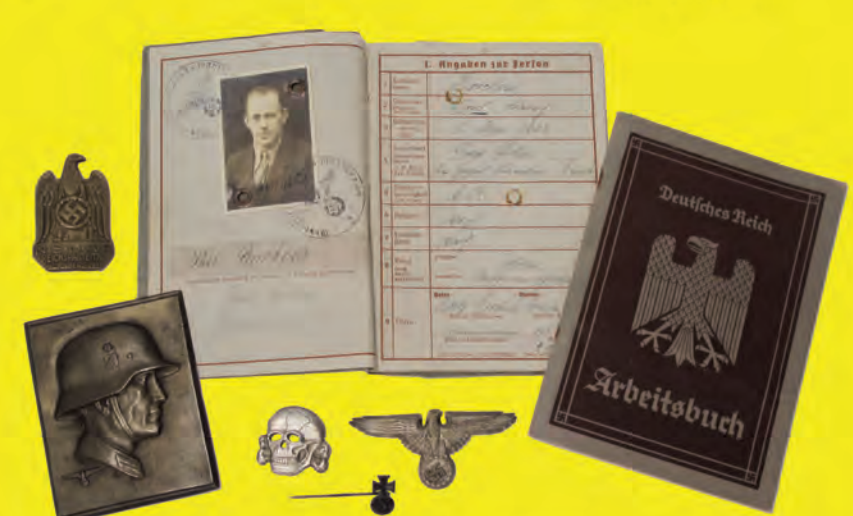
Collection of WWI & WWII Ephemera

UPSTATE NEW YORK'S PREMIER GUN AUCTIONEERS!