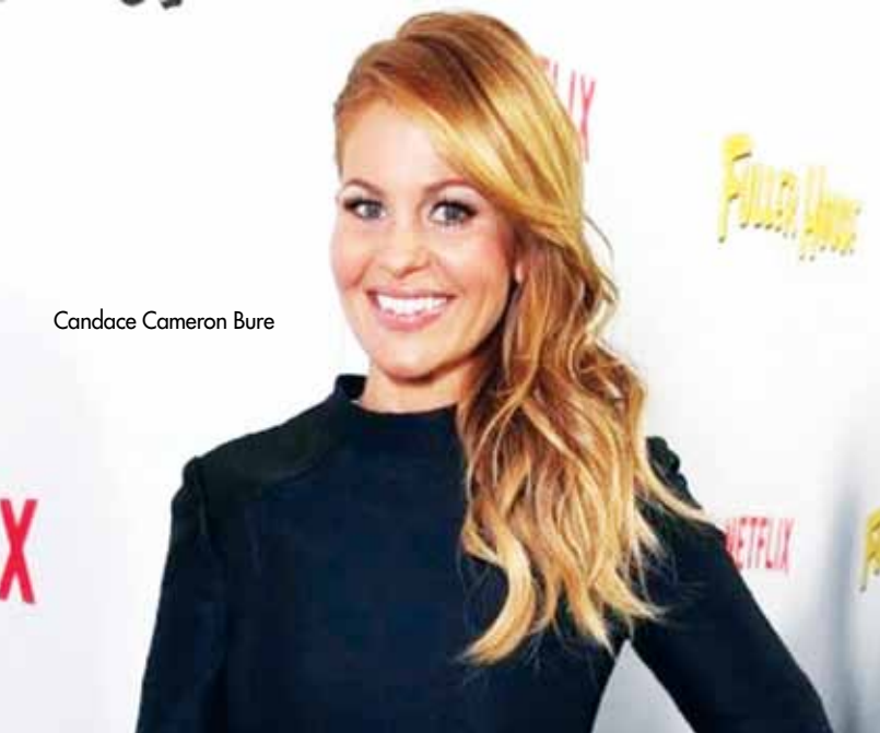
Candace Cameron Bure