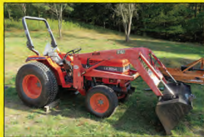
Kioti LK3054 4WD Tractor w/Loader