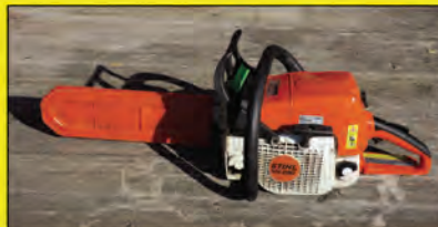
Stihl Chain Saw