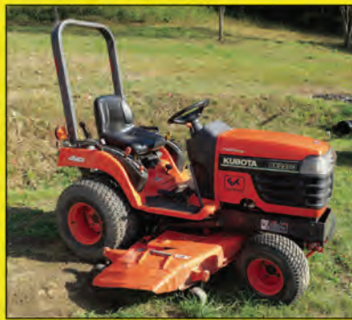
Kubota BX2200 4WD Subcompact Tractor w/60" Mower & 3 pt. Hitch

• NO RESERVES • ABSENTEE BIDS ACCEPTED •