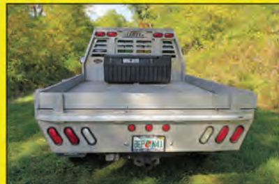
2005 Ford F-250 XLT Super Duty Diesel