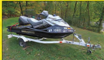
2008 Sea-Doo RXT215 Jet Ski w/ Trailer