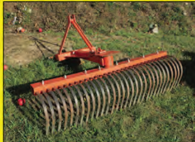
Kubota York Rake