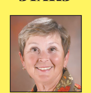
Lic. Assoc. R.E. Salesperson*