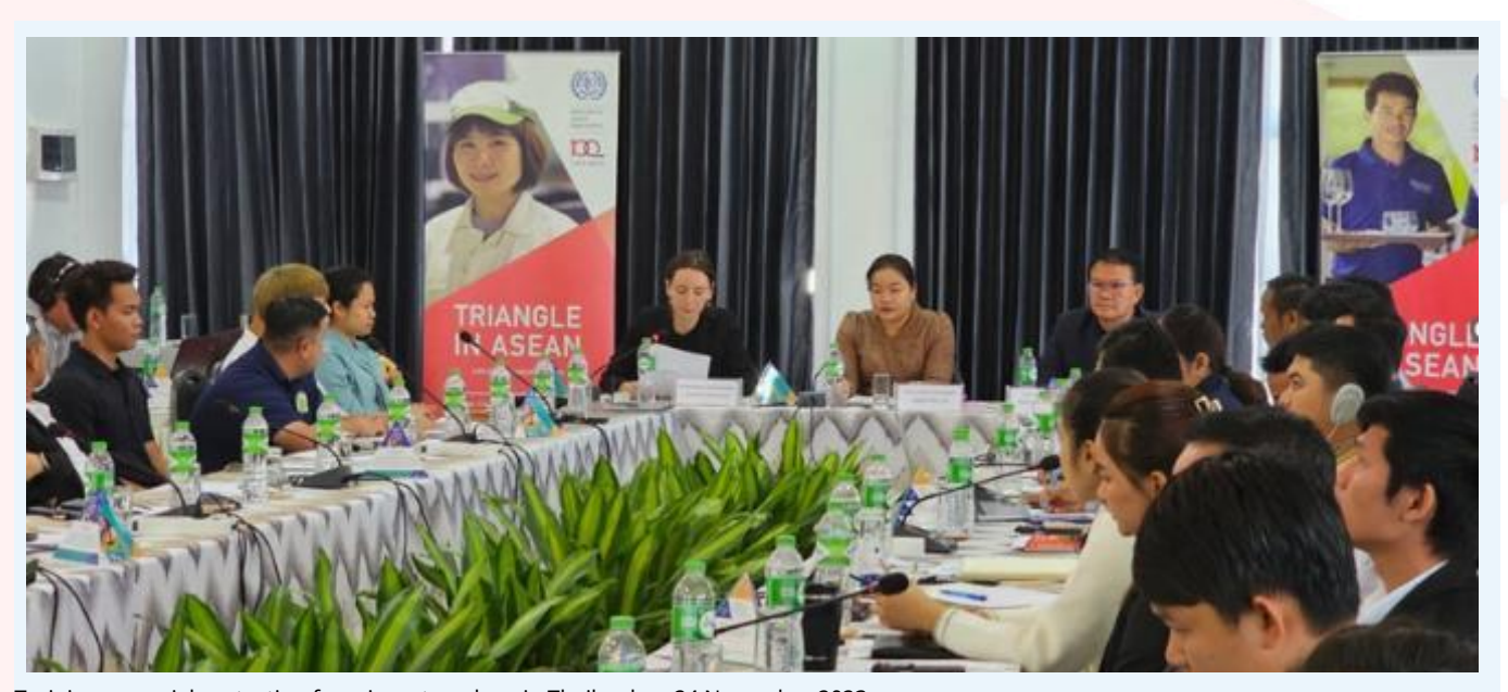
Training on social protection for migrant workers in Thailand on 24 November 2023.

On 24 November, TRIANGLE organized a training on social protection for migrant workers in Thailand . The training targeted staff from the three TRIANGLE-supported MRCs and representatives from 48 recruitment agencies that send migrant workers from Lao PDR to Thailand. TRIANGLE presented information on Thailaws and regulations on recruitment, social security, assistance with grievances, and barriers some migrant workers face in accessing assistance. Participants agreed to increase the coordination between MRCs and recruitment agencies in the future. The training was attended by 63 persons (W:19; M:44).