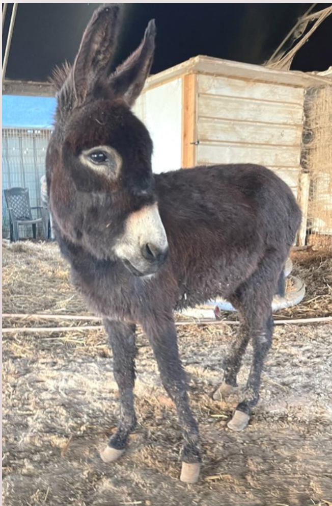
...and after a bit of a grooming!

His mother must have felt distraught because in the end the owner just left him by the way-side to try to fend for himself.